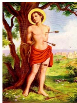
Jan 21 Sunday Feast of St. Sebastian