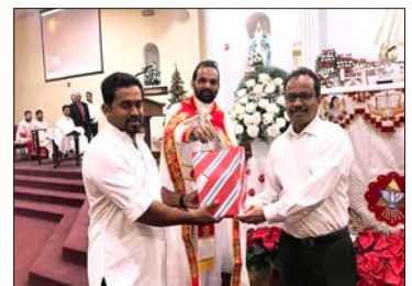
St. Francis Xavier Koodarayogam