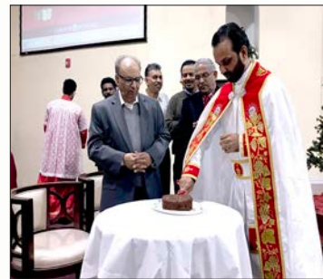
Christmas Cake Cutting Ceremony