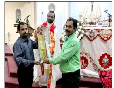
St. Jude Koodarayogam Highest Number of Homes Visited