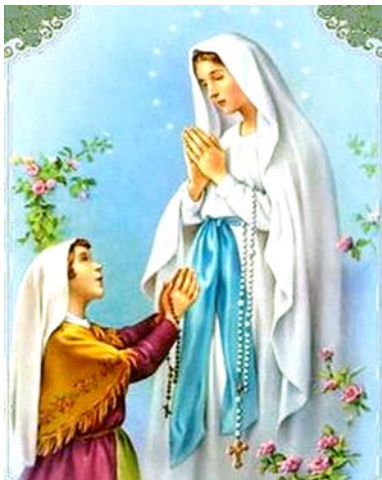
Feast of Our Lady of Lourde

March 23 St.Xaviers /Ave Maria/St.Teresa of Calcutta