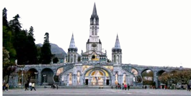
Basilica of Our Lady of the Lourde