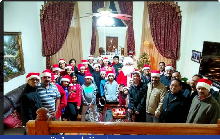
St. Joseph Koodarayogam

920 FM 1092 Rd, Suite # 204, Stafford, TX - 77477 For Individuals & Business Entities