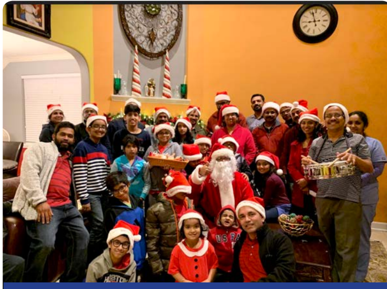
St. Xavier Koodarayogam