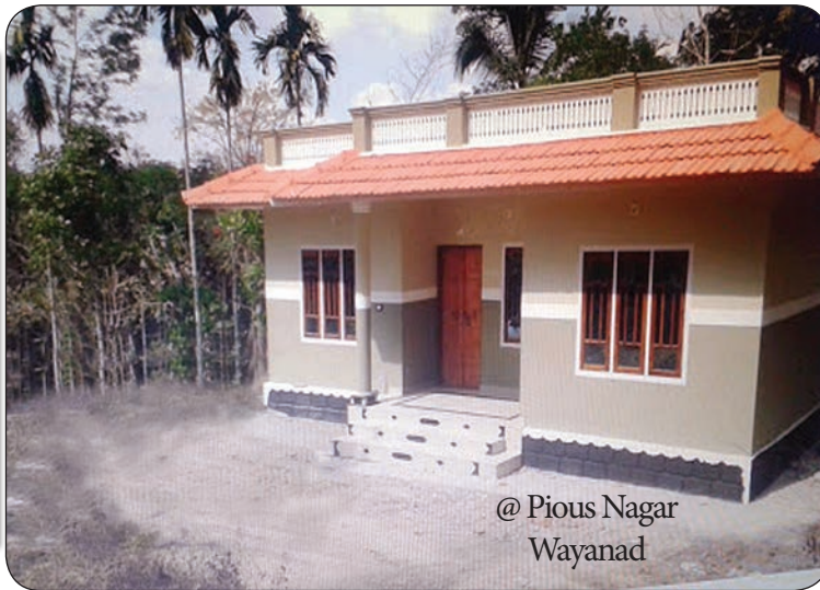
@ Pious Nagar Wayanad