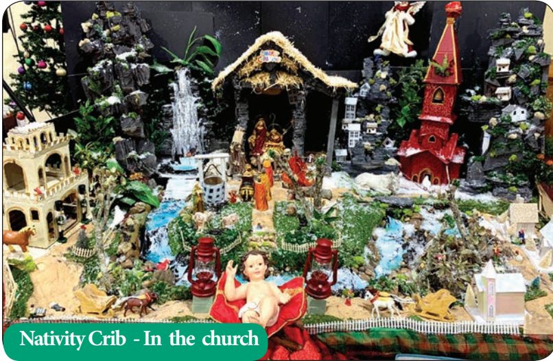
Nativity Crib - In the church