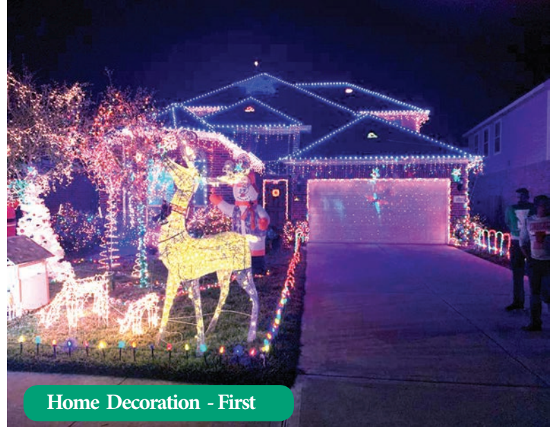
Home Decoration - First