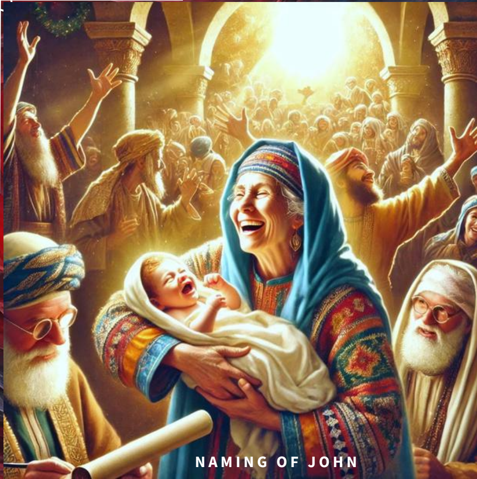
NAMING OF JOHN