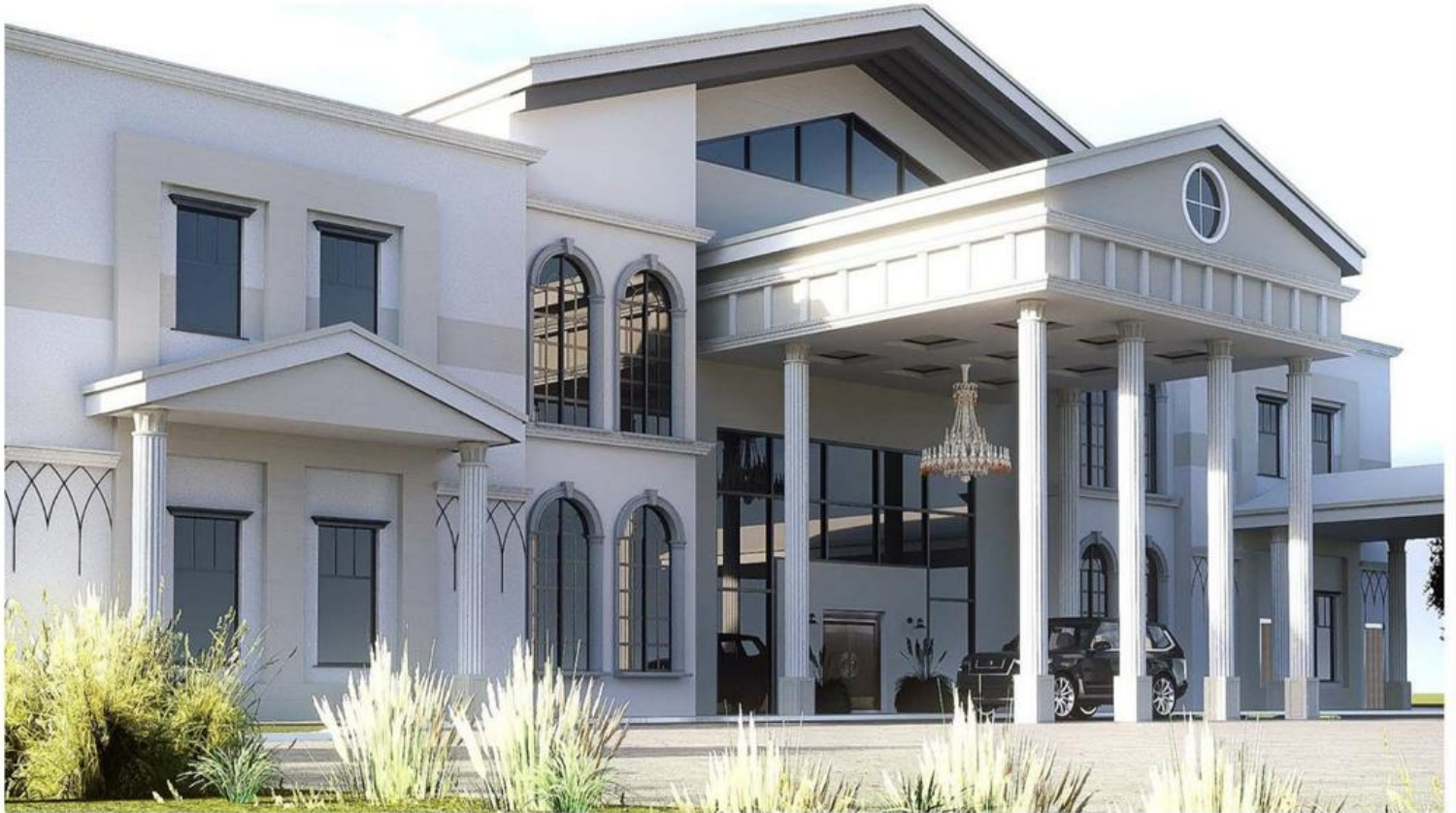
FRONT ELEVATION DRAFT OF THE PROPOSED MULTI-PURPOSE PARISH PASTORAL CENTER OF HOUSTON ST. MARY'S KNANAYA CATHOLIC PARISH.