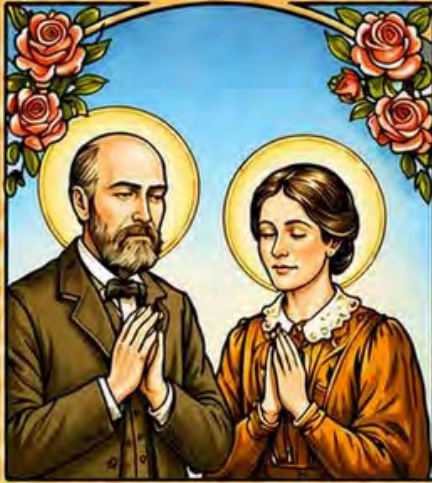
A family that prays together